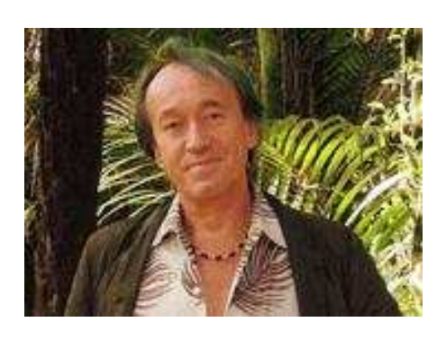
Patrick Blanc www.verticalgardenpatrickblanc.com/