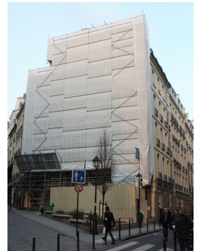
In February, the building facade was prepared to install plants.

The gardens have built-in watering systems and require limited maintenance that consists of removing dead leaves or replacing plants that don't thrive.