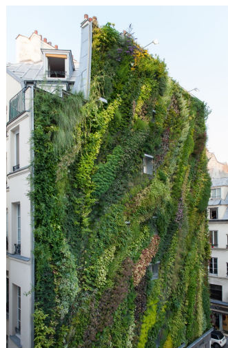
The wall in full bloom.

2007 interview, a plant wall in his living room had been there for 25 years.