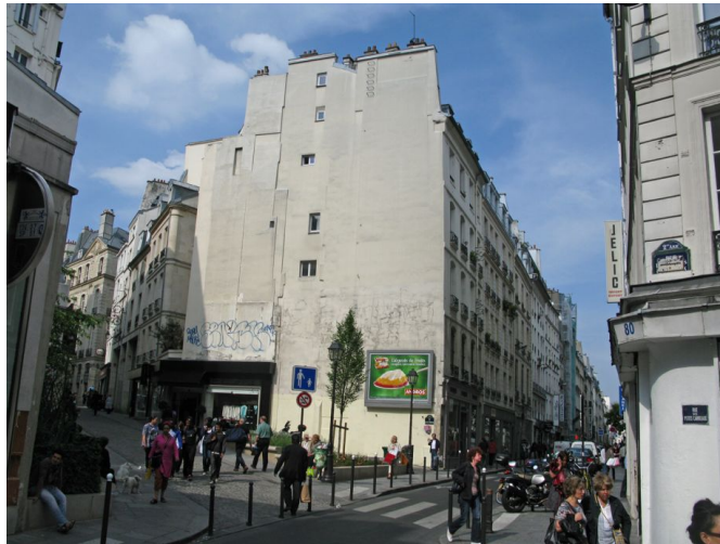
Patrick's Blanc's blank canvas on rue d'Aboukir.

Last week Blanc inaugurated a new vertical garden blanketing 2,700 square feet of an 82-foot-tall wall with 236 different kinds of plants. The plant wall is designed in a verdant wave pattern on a formerly drab southwest-facing Parisian street corner at 83 de la Rue d'Aboukir in the 2nd arrondissement.* He calls it a “hymn to biodiversity.”