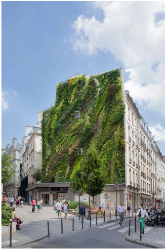
L'Oasis d'Aboukir, a new vertical garden on the side of a residential building in Paris.

Patrick Blanc is a French botanist and designer who invented the concept of the vertical garden and has been on a quest to green walls across the planet with his plant-based creations for the last 25 years.