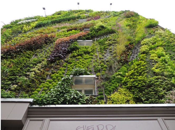
A close-up of the vertical garden on rue d'Aboukir.

recent projects in the deserts of Saudi Arabia and Bahrain.