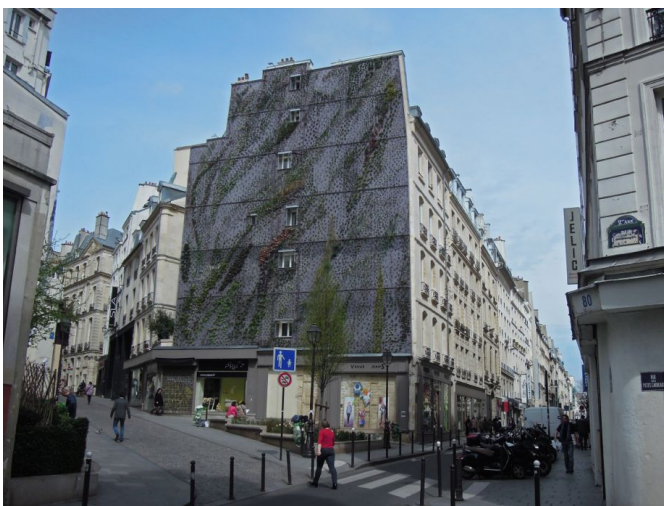
One week after plant installation in April.

The garden can thrive over time. When I visit Blanc's home during a