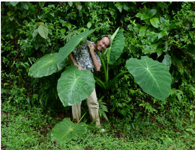
Patrick Blanc in Indonesia last spring.

Still, it's easy to imagine how greener walls could create urban utopias cities the world over. The rooftop garden has had an urban renaissance. Why not a vertical garden revolution?