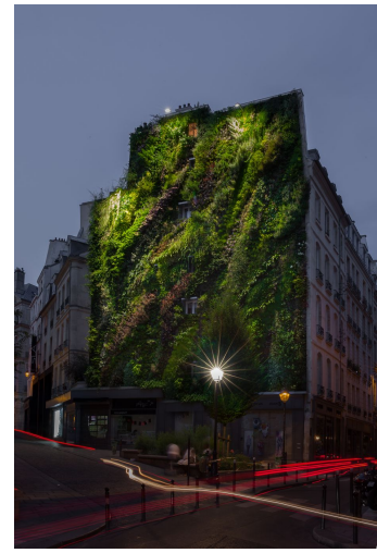
The vertical garden at night.

revelation making you wonder why city governm around the world don't use vertical gardens