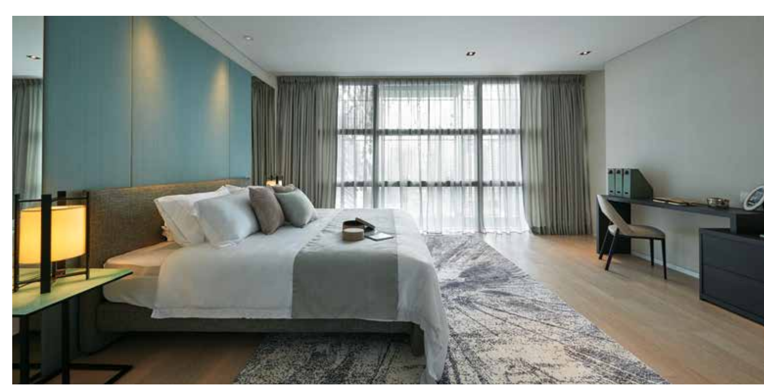
The use of precious materials, intricate details combined with a mix of light and dark colours make up an incredibly stylish and classy atmosphere

However, it is in the 1,894 sq ft duplex unit with a breathtaking double-volume ceiling that Saporiti's design language truly takes flight. It uses a careful interplay of elegant fabrics and stylish lacquered wood to create a delicate-yet-vibrant, timeless and classic setting. In the bedrooms, light colours are chosen to provide brightness and freshness. In the master bedroom, warmer colours are adopted for a touch of class and elegance. Sophisticated wallpapers, carpets and accessories complement specially commissioned artworks to lend a sense of refinement to the entire apartment.