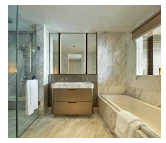
Every unit features an expansive master bathroom wrap in Volakas Marble

Each firm took creative control of selected units across various layouts and the results are impressive: While each home subscribes to a very different aesthetic, all of them do have certain common elements — extravagance in the service of restrained style, an eye for unique and personalised touches and a generous use of practical luxury.